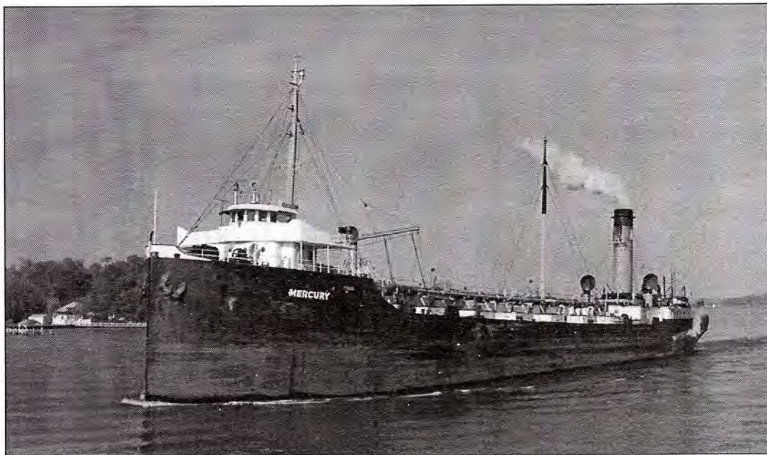
* MERCURY at Willow Point on the St. Clair River *