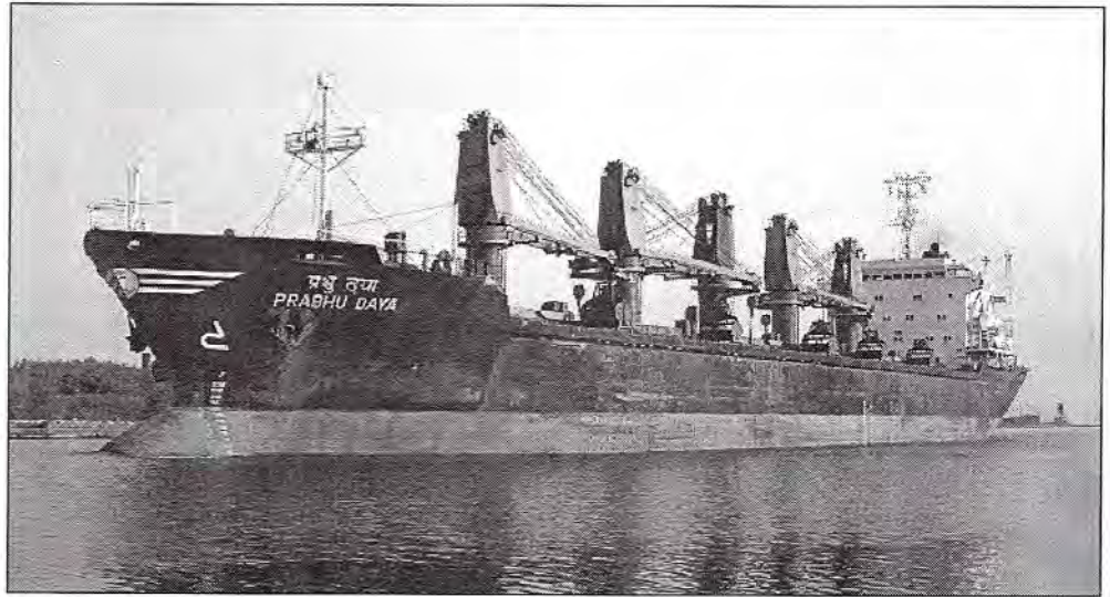
* PRABHU DAYA upbound in the Welland Canal on August 15, 1998

This ship is of a familiar design with others of the same design being NAND RATI , and LOK PRAKASH . Though not a regular visitor to the Lakes, it was nice to see that she made the Port Huron / Sarnia area one of her lake ports of call