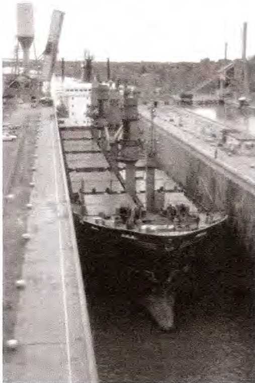
Gladys Bowater in the Welland Canal late 1970.

This ship was built as a newsprint carrier and the builder was known for their expertise in this particular field. She was a good looking ship and well maintained with a dark green hull and cream upper works. Originally her boot topping was light green but because it was hard to maintain, this was changed to red.