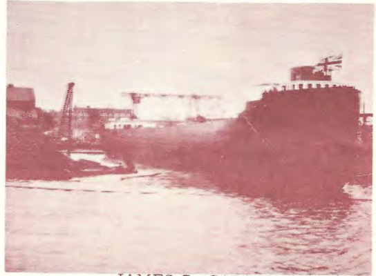
JAMES C. CARRUTHERS

reservations now. It is a package deal that is hard to beat, with transportation and lodging, all inclusive.